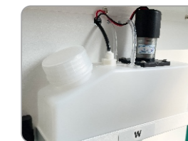
White stir & circulate