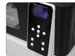
Bilingual operating system