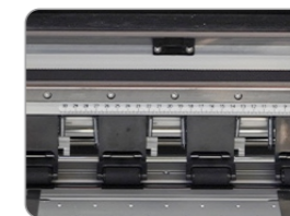
High precision guide rail