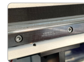
HIWIN guide rail